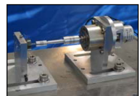
Fig.3 : Micro motors test bench