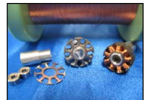
Fig.2 : BLDC motor integration