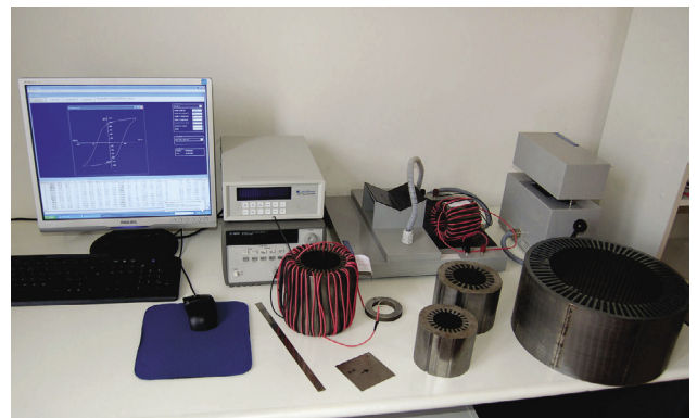
Fig. 1: Measurement equipment for soft magnetic materials characterization up to 1000 Hz.

Spatial parameters can be very useful in defining a more realistic magnetization pattern in the device, for example, it