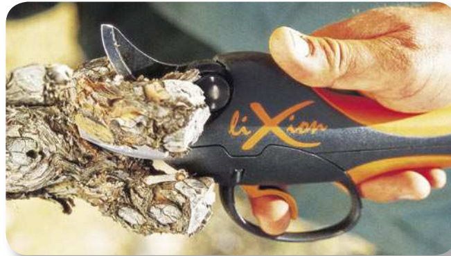
LiXion (pruning shear)